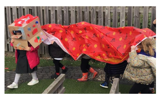
The children really enjoyed learning about Chinese New Year.